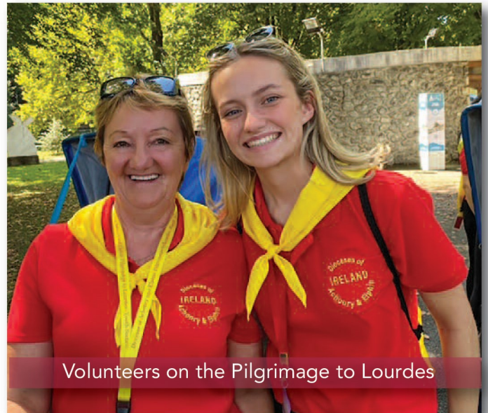
Volunteers on the Pilgrimage to Lourdes