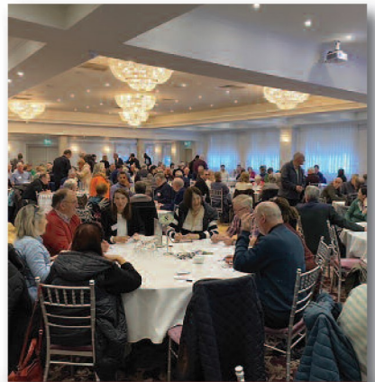
Members of Parish Pastoral Councils meet for joint assembly