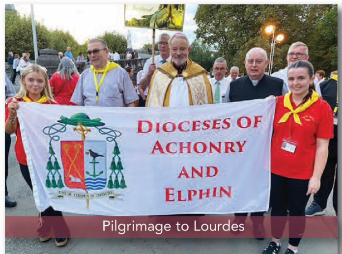
Pilgrimage to Lourdes