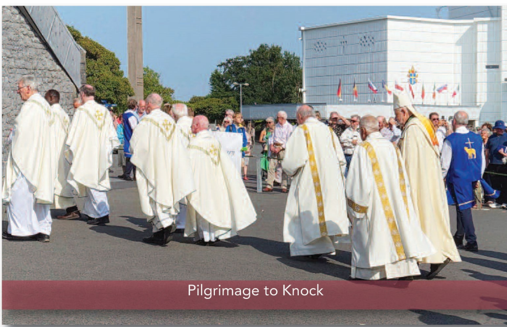
Pilgrimage to Knock