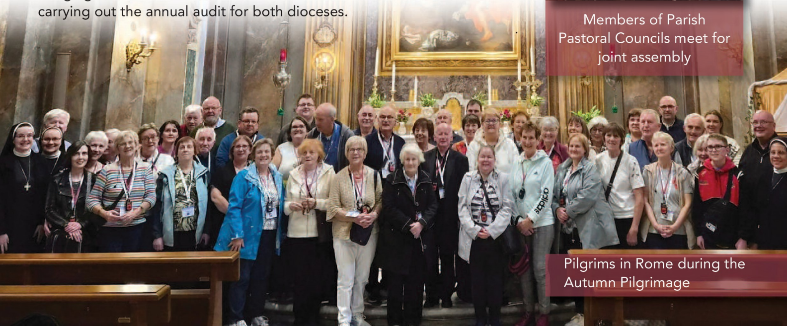
Pilgrims in Rome during the Autumn Pilgrimage