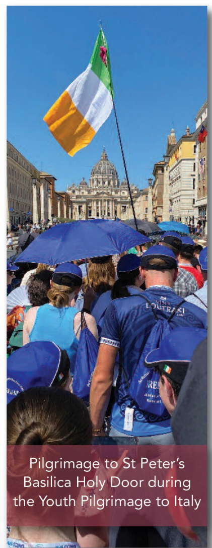
Pilgrimage to St Peter's Basilica Holy Door during the Youth Pilgrimage to Italy