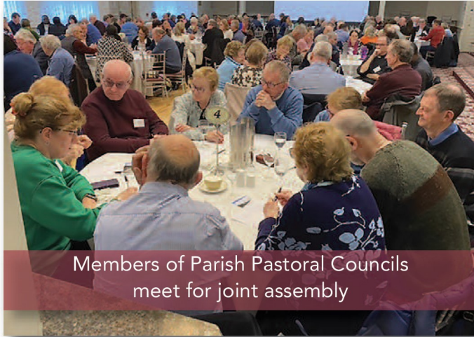
Members of Parish Pastoral Councils meet for joint assembly

I am conscious that most parishioners in Achonry and in Elphin will not have noticed much change on the ground. In many ways, that is good news, because much of the change is at diocesan level and our parishes continue to function effectively and to provide the pastoral care that people need on a daily basis. The kind of change that we need to see when merging two dioceses is primarily organic growth. It is like the change that you see in your children, or indeed in your garden, or on the farm. It happens slowly over time, but it is real growth. If there is structural change, it has to be focussed on supporting spiritual growth and the maturing of our parish communities.